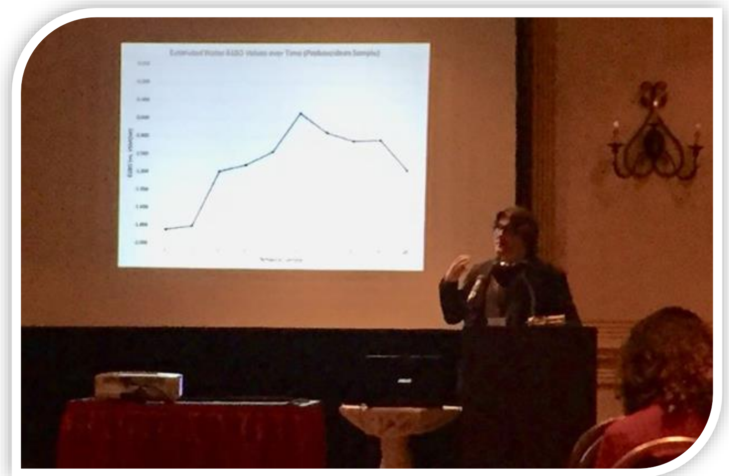
A presenter at a professional archaeological conference, Fall 2019