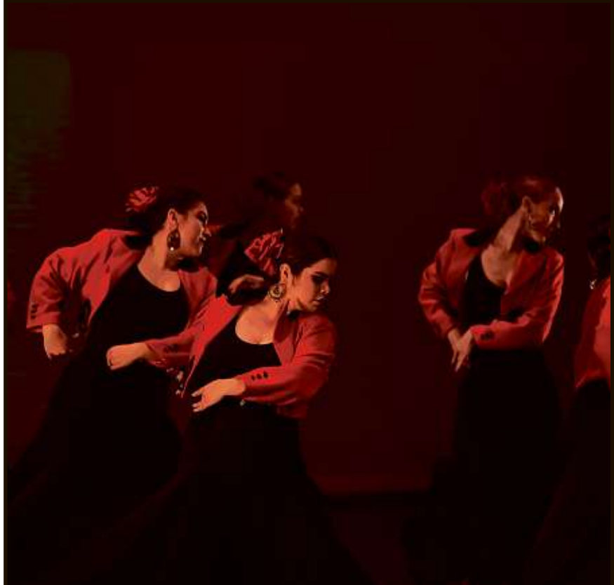
Spring Dance concert performers