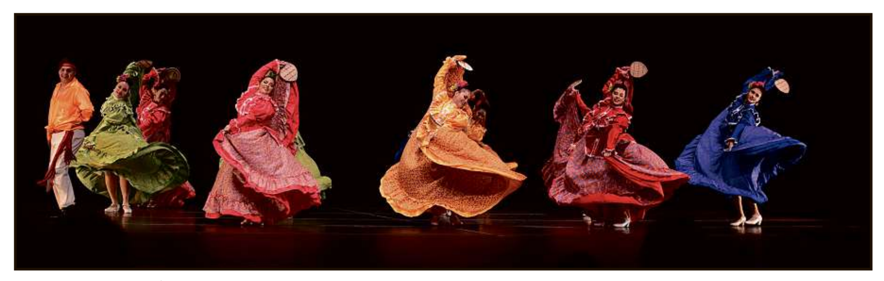
Spring Dance concert performers