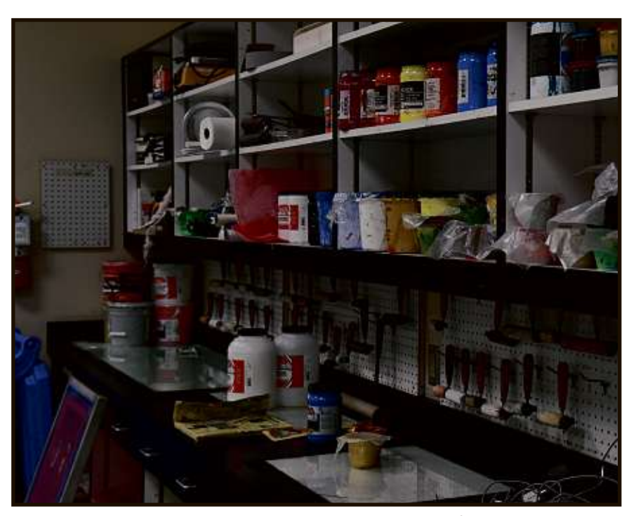
The TAMIU Printmaking studio and the students and staff's materials

that's in our backyard. That's where international poster printers go and it's like their Comic-Con."