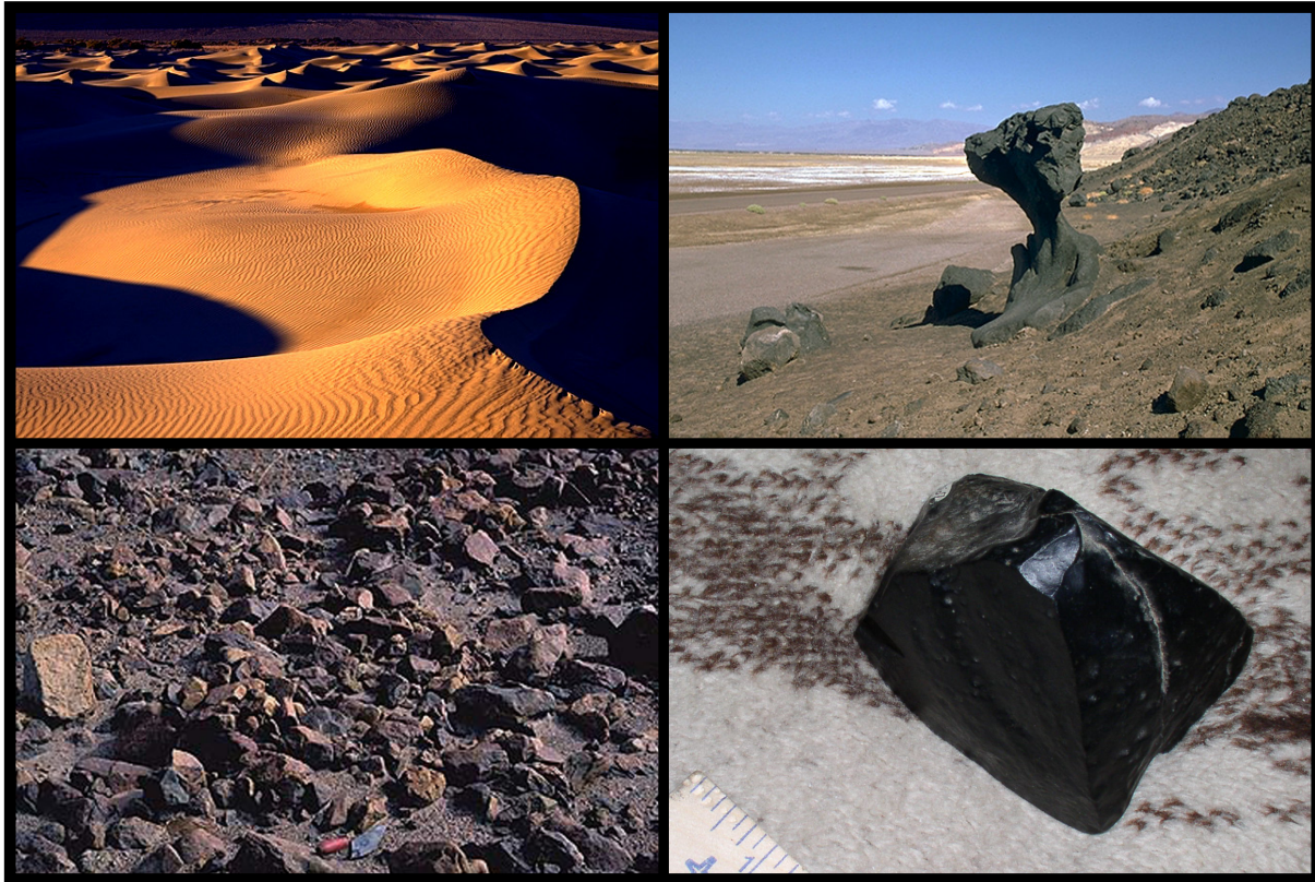
Figure 2. Picture of sand dunes and other desert features

The two major processes that result in erosion and deposition of loose unconsolidated material on the earth's surface is running water (fluvial processes) and wind (eolian processes). In regions with dry climates it would be natural to assume that eolian processes would dominate over fluvial processes. However, precipitation events in dry climates, while sporadic, are commonly intense. Downpours associated with isolated thunderstorms can dump inches of precipitation over a small area in the course of an hour or two. These downpours result in a rapid accumulation of runoff in intermittent streams that can cause flash floods. During these flash floods, significant erosion can form deep stream valleys and transport large quantities of sediment.