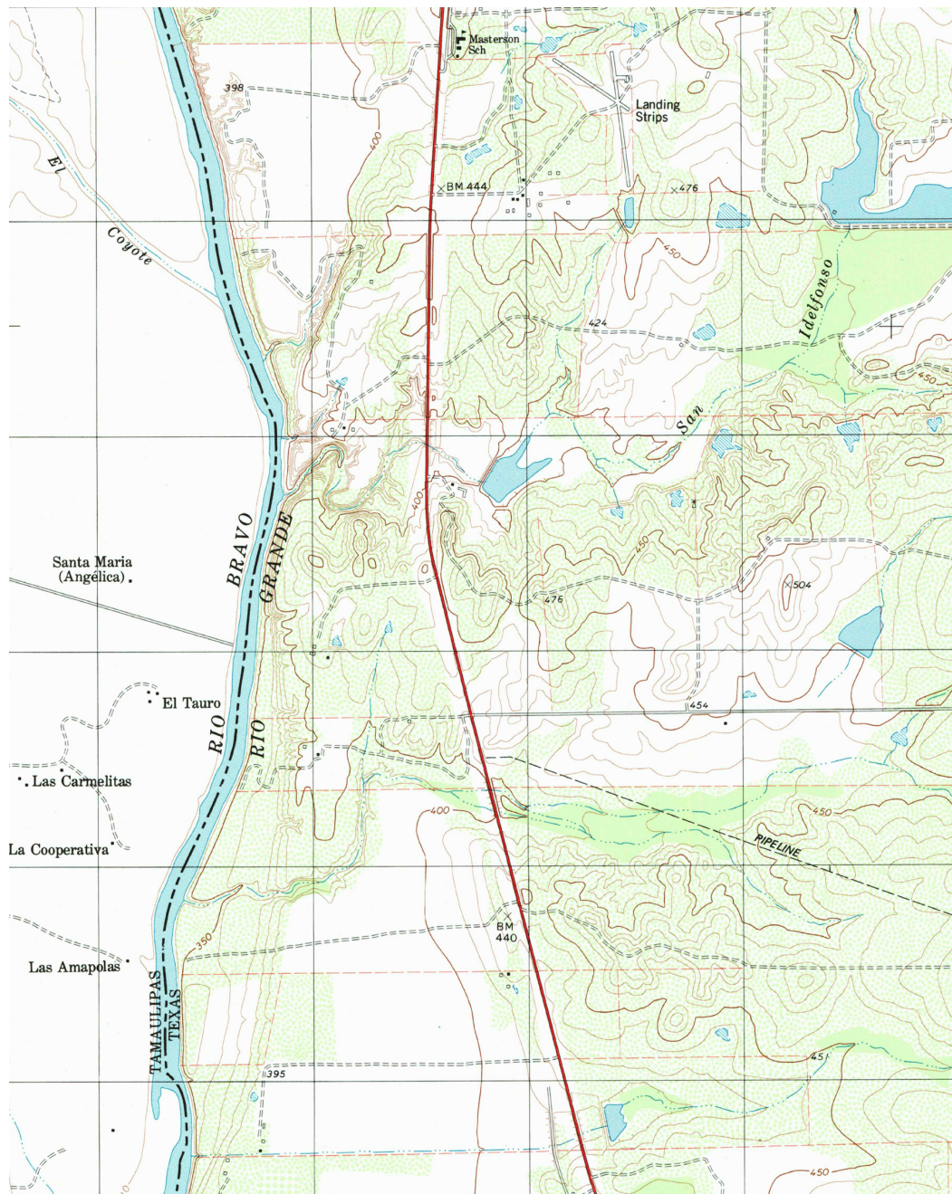
Figure 4. A portion of the South Laredo Quadrangle map.