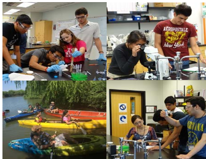
Participants of Summer Research Week work on hands-on activities promoting their discipline-specific undergraduate research capabilities.

This workshop takes place every summer, mostly in July. It is a week long workshop that includes 10 modules. Students will complete 30 hours of lecture and activities to embellish their research experience. Participating in this workshop will expose students to cutting edge research techniques and methodologies that are applicable to a wide range of fields. Participants will be trained in developing testable hypotheses, utilizing technology and critical thinking to analyze data, drawing appropriate conclusions, as well as the effective communication of experimental results.