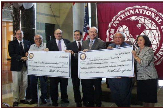
Congressman Henry Cuellar presents $1.5 million in Grants to TAMIU for STEM Programs which include the TAMIU Building Scholars.

TAMIU and LCC jointly serve the predominately Hispanic community, a group historically underrepresented in research careers and positions of leadership in the nation. The goal of this program is to increase the number of Hispanic and low-income students completing a college degree, thus increasing the competency and diversity of our workforce. Building Scholars consist of activities developed by Texas A&M International University (TAMIU) and Laredo Community College (LCC), including: (a) Provide undergraduate research and presentation opportunities across disciplines and develop a summer research week, (b) Implement a program for departmental faculty to teach University Seminar 1102 to first-year students that is discipline specific, (c) Provide specialized resources and instruction for all developmental students, (d) Improve the number of full-time students who have a developmental background that persist and graduate, (e) Fund travel to professional conferences for training, building collaborations & presenting research results, (f) Host an annual faculty development training for faculty at both institutions, (g) Perform analysis on current protocols for sharing data and make recommendations and improvements, and (h) Track student progress and retention.