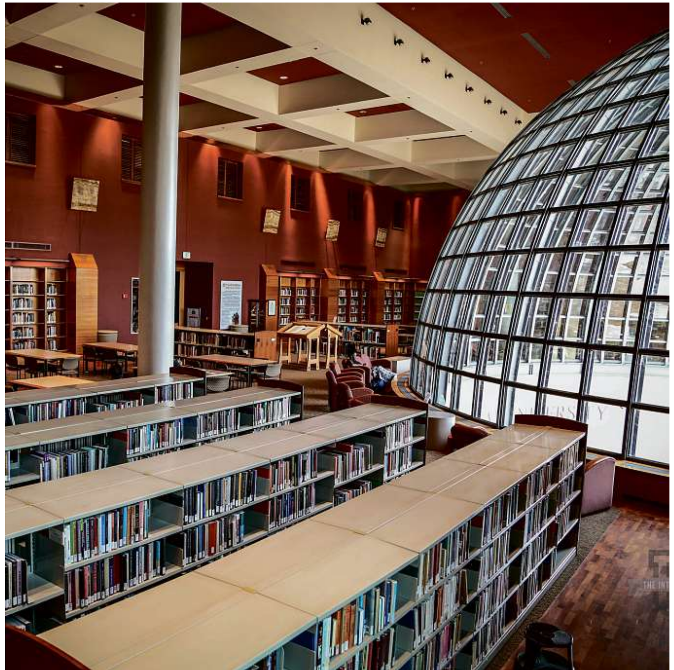
An inside view of the Sue and Radcliffe Killam Library.

"We have plans to expand our doctoral offerings to include degrees in criminal justice, border studies, education, eventually biol-