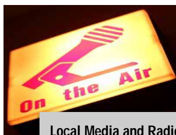
Local Media and Radio