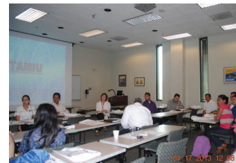
Students and representatives of NGOs during a group discussion in the last IES.

17: International Executive Seminar (IES): “Rio Grande River: Our Friend and Foe”. Speakers from both sides of the border, the Rio Grande International Study Center, the International Boundary and Water Commission and the Comisión Internacional de Límites y Aguas (CILA) of Nuevo Laredo, presented to a group of non governmental organizations from Nuevo Laredo, as well as students from the Universidad Tecnológica de Nuevo Laredo and other guests from Laredo. BINC is organizing a program for binational youth related to environmental issues.