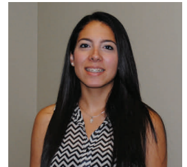
Student Research Assistant