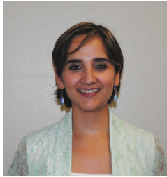
U.S. México Relations Coordinator