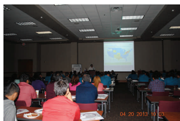
Students from the Instituto Tecnológico de Nuevo Laredo.