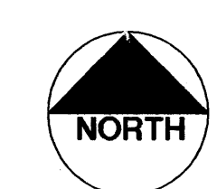
MECHANICAL - CENTRAL ENERGY PLANT FLOOR PLAN SCALE: 1/8" = 1'-0"