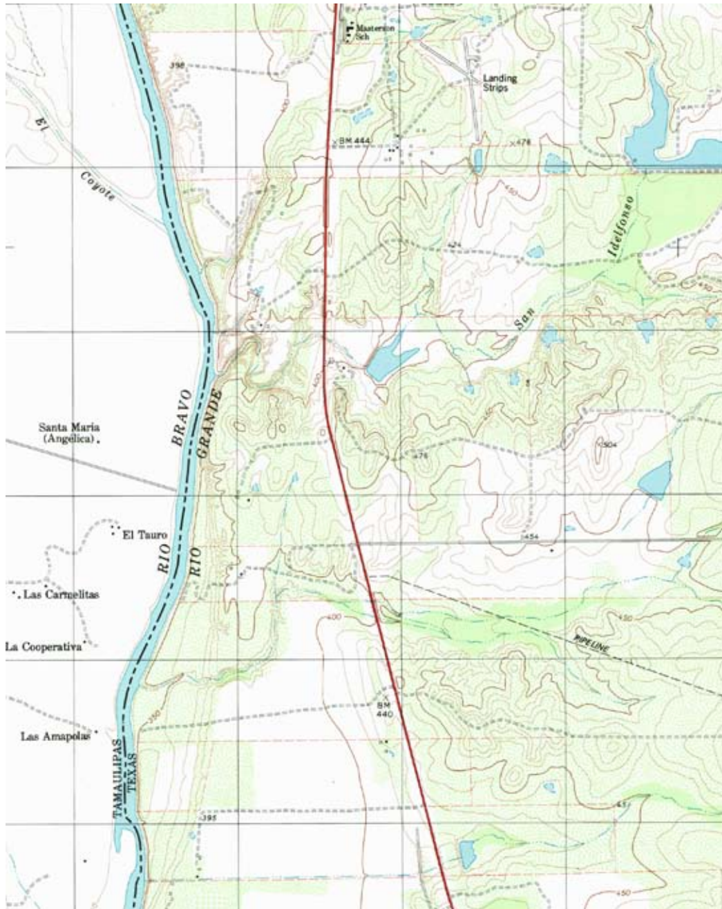
Figure 4. A portion of the South Laredo Quadrangle map.