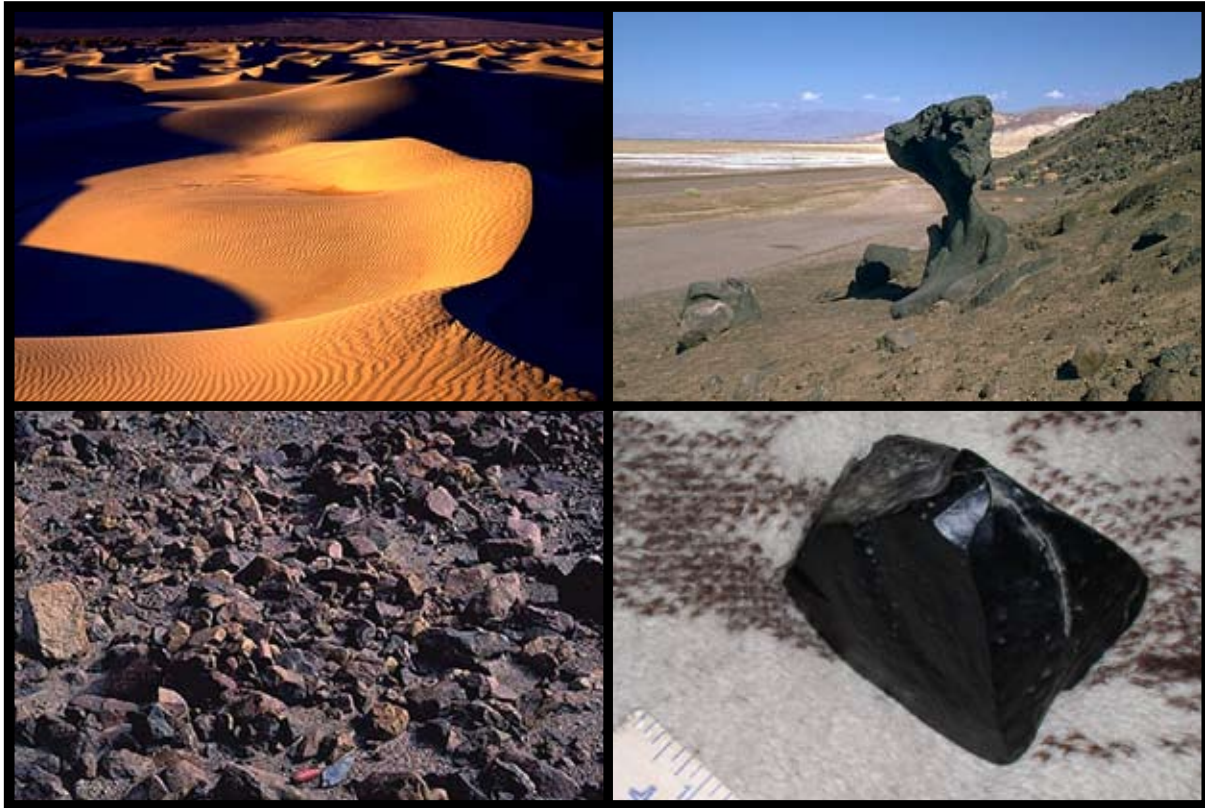
Figure 2. Picture of sand dunes and other desert features

The two major processes that result in erosion and deposition of loose unconsolidated material on the earth's surface is running water (fluvial processes) and wind (eolian processes). In regions with dry climates it would be natural to assume that eolian processes would dominate over fluvial processes. However, precipitation events in dry climates, while sporadic, are commonly intense. Downpours associated with isolated thunderstorms can dump inches of precipitation over a small area in the course of an hour or two. These downpours result in a rapid accumulation of runoff in intermittent streams that can cause flash floods. During these flash floods, significant erosion can form deep stream valleys and transport large quantities of sediment.