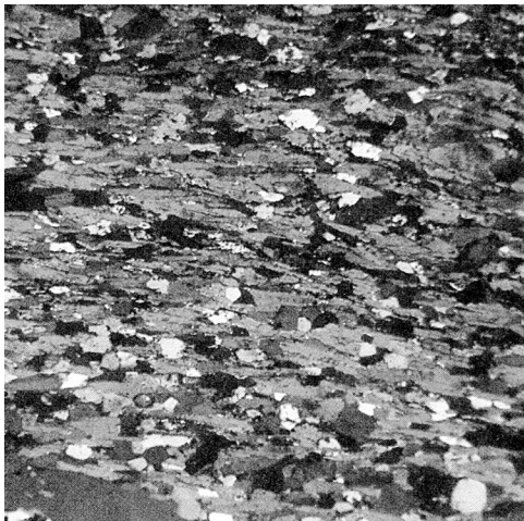
Alignment of large micas due to the pressure of regional metamorphism producing the foliated texture in a schist

Another common starting protolith is a granite. Like shales, granites are fairly common rock types. Granites also undergo recrystallization under increasing metamorphism. But, unlike shales, the minerals in a granite separate out into distinct bands of different compositions during increasing metamorphism. A gray granite protolith will yield a banded rock with alternating