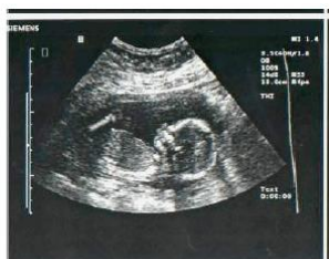
ultrasound, 17 weeks