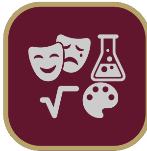
COLLEGE OF ARTS AND SCIENCES