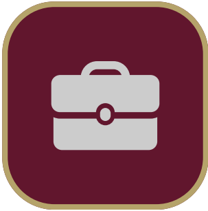
A.R. SANCHEZ, JR. SCHOOL OF BUSINESS