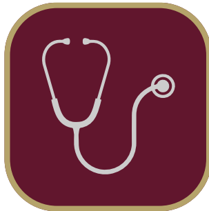
COLLEGE OF NURSING AND HEALTH SCIENCES