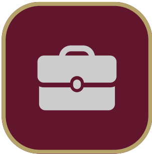
A. R. SANCHEZ, JR. SCHOOL OF BUSINESS